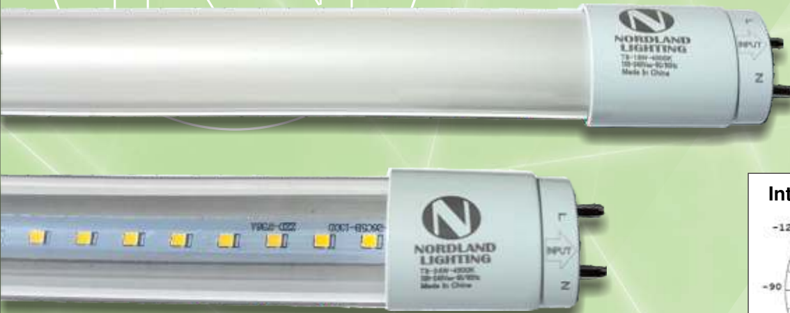
Intensity Distribution Diagram

The T8 LED Tube has been characterized by its long life, high lumen efficacy and high safety performance. The LED tube is manufactured from clear or frosted glass and they replace the traditional T8 fluorescent lamps. The LED tube has a built-in constant current driver, with over current and over voltage protection. High light transmittance and soft light colour, available in 1200mm and 1500mm lengths. 600mm LED tubes are available on request.