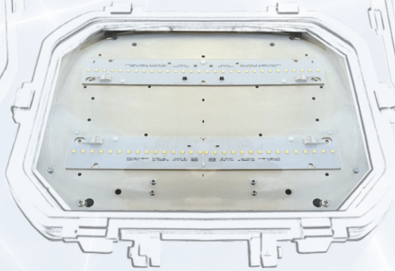
NGB - HB LED