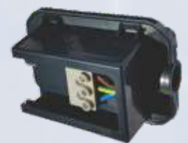
MiniLite Power Box

Example of MiniLite with Power Box connection on Steel Wire Armoured (SWA) Cable for haulage application. Various pre-wired options available on request.